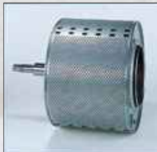
The exclusive drum construction in AISI-304 stainless steel and the treatment of the V-ring sealing shaft provide positive protection to the main bearings.

Girbau's washers inner and outer drums are AISI-304 stainless steel to help extend the life of each machine.