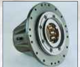
Unique, one piece bearing design provides optimum structural support and lasting bearing performance.

Efficient G force water extraction of >300 saves valuable drying energy up to 200 kcal/kg. linen. The analogue pressure transmitter for 6 water levels allows to a minimum consumption of water, enabling operators to efficiently handle all type of load requirements.