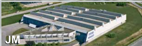
FACTORY Jean Michel: Automation machinery for heavy-duty installations (handrail conveyor systems, feeders, folders, stackers, etc.)