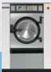
Option: Saturn Grey colour