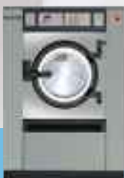
Basic: Stainless steel