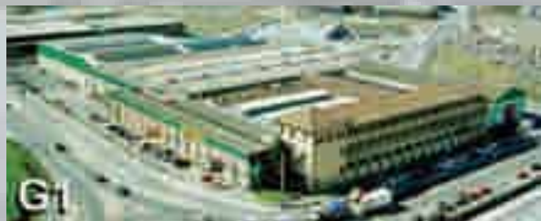
FACTORY GIRBAU 1: washer extractors and flatwork ironers