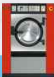
Option: Mars Red colour