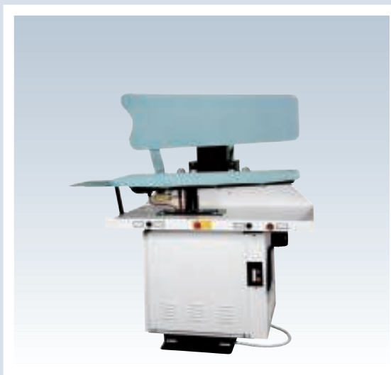
F3AA3 leg shape press