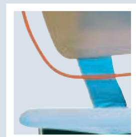
F3AB1 Utility Laundry Press