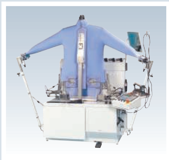
F4VA1 shirt finisher

The machines are easy to use, even for unskilled operators, ensuring high output and consistency. In fact, one operator can process up to 40 shirts every hour*.