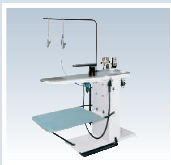
F3SA spotting table

This is the end of stains for you and your customers!