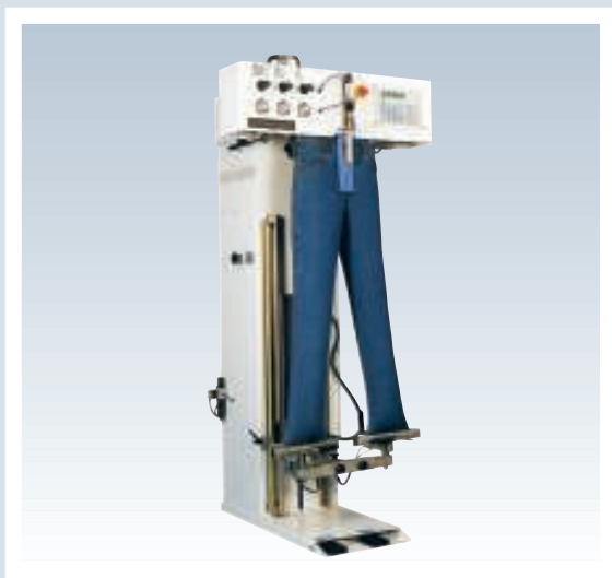
F4CD trouser conditioner

Electrolux Professional's systems for finishing trousers are designed for maximum operator safety. The equipment is also easy to use, which allows the operator to process a large number of finished garments.