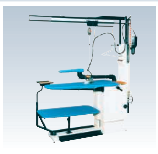
F3TK1 finishing table

The professional F3TK1 finishing table has many features such as a powerful vacuum and hot air blowing that help even unskilled operators achieve high output and quality finishing results. For your cleaning operation, this means higher productivity and improved economy.