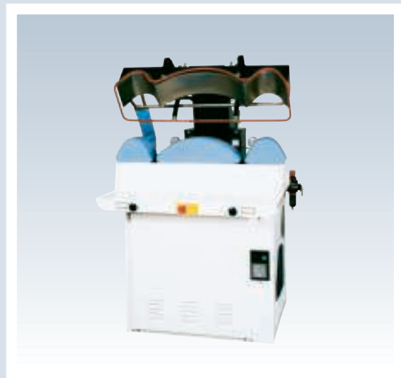
F3AB2 collar and cuff press