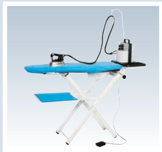
F4TD ironing table

The portable F4TD ironing table is an example of a simple, low-cost alternative to the traditional ironing table. It is ideal for laundries with low output demands and limited floor space. Because this ironing table is electrically heated, installation is simple. All you need is a domestic electrical supply. Every F4TD ironing table comes with a durable, self-feed steam iron. The F4TD ironing table is equipped with a small boiler that gives you 2 hours of continuous ironing. The table allows you to do easy touch-up. It can be installed in your drop off store or by the counter for excellent quick and easy touch-up.